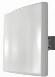
High Density 13 dBi Patch Antenna