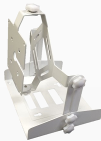
Universal AP & Antenna Mount