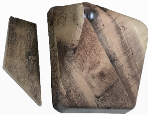
Custom Enclosure Cover Skinned to Match the Wood