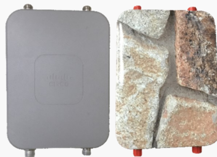
Cisco AP-1542 Before and After Skinning