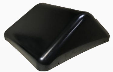
Ceiling or Wall Enclosure