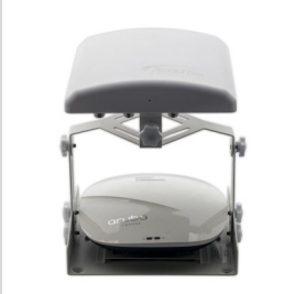
AP and Antenna Articulating