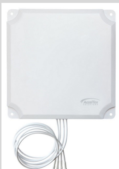
WHSE Patch Antenna

"...A special antenna with a 15(H) x 120 (V) beamwidth that is absolutely fantastic for meeting warehouse coverage needs."