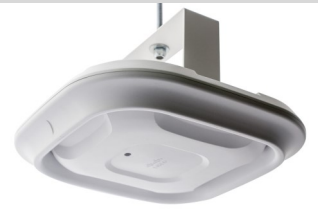
AP Drop Mount